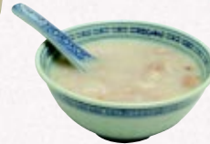
dumplings and congee