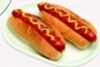
hamburgers and hot dogs