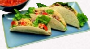
salsa and tacos